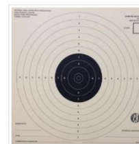
E.g., Paper Target

All shooting will be completed at 10m distance. The qualification events are likely to be shot on paper targets and the National Final on MegaLink electronic target system.